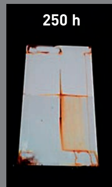
Anticorrosive primer based on Ecrylic KS 447