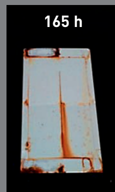
Anticorrosive primer based on competitor (styrene acrylic emulsion)