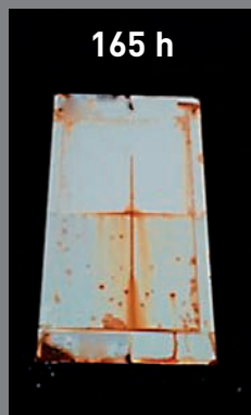
Anticorrosive primer based on competitor (styrene acrylic emulsion)