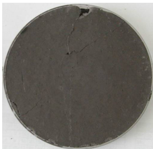
METOLAT® P 588